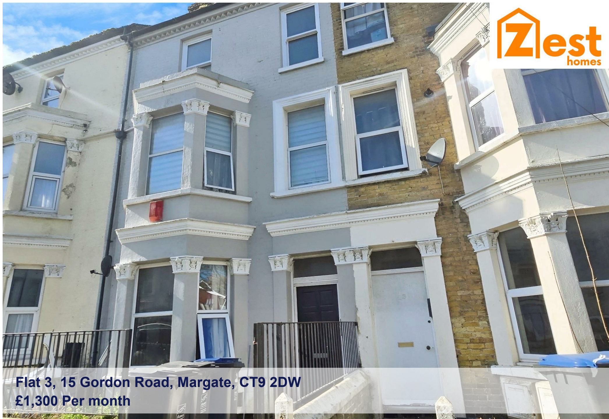
Flat 3, 15 Gordon Road, Margate, CT9 2DW £1,300 Per month